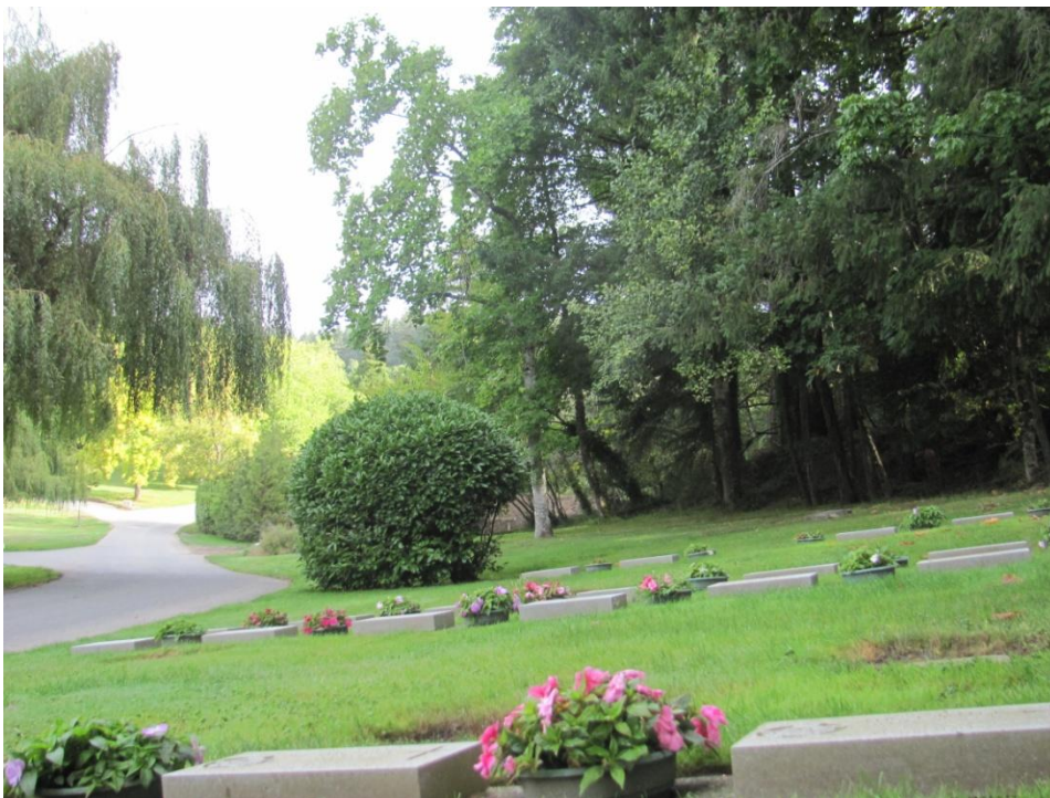
War Graves plot at Royal Oaks Burial Park