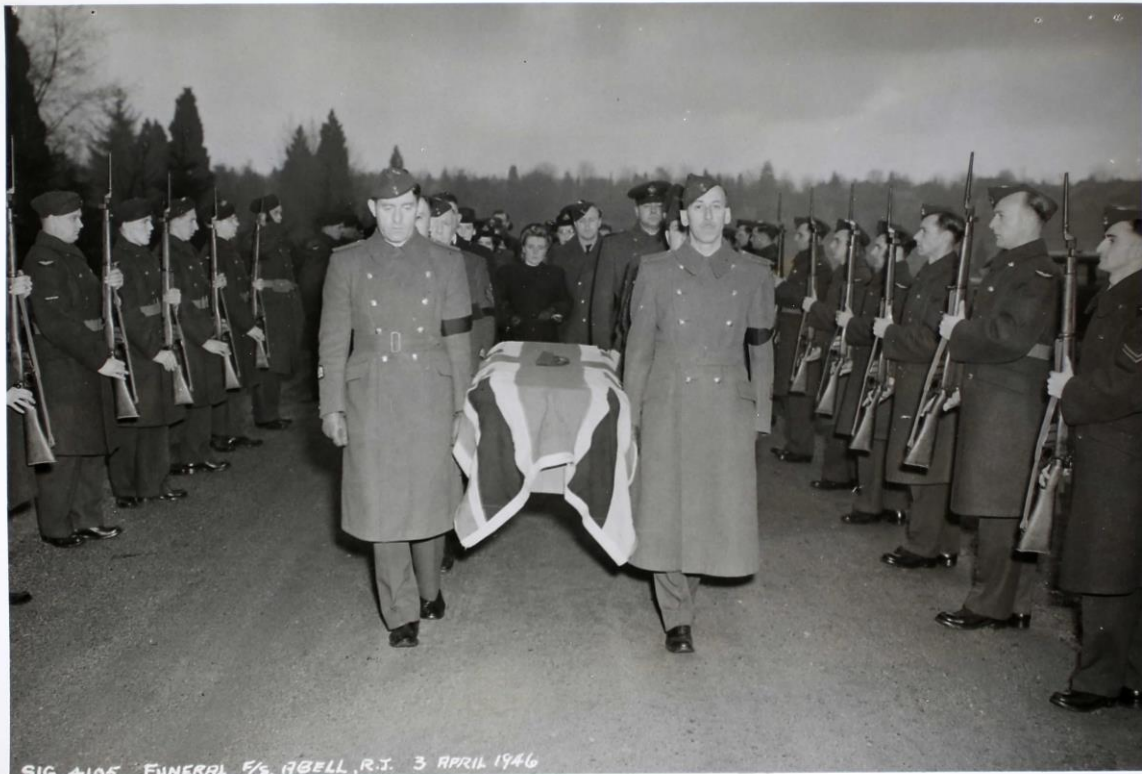
SIG 4105 FUNERAL F/S ABELL, R.I. 3 APRIL 1946