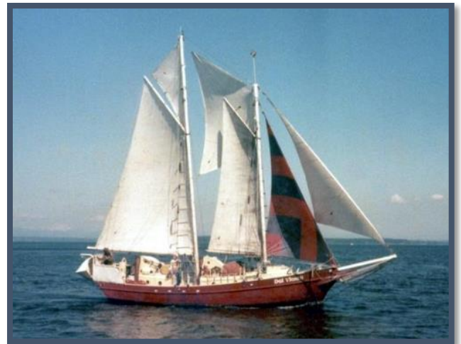
The Del Viento