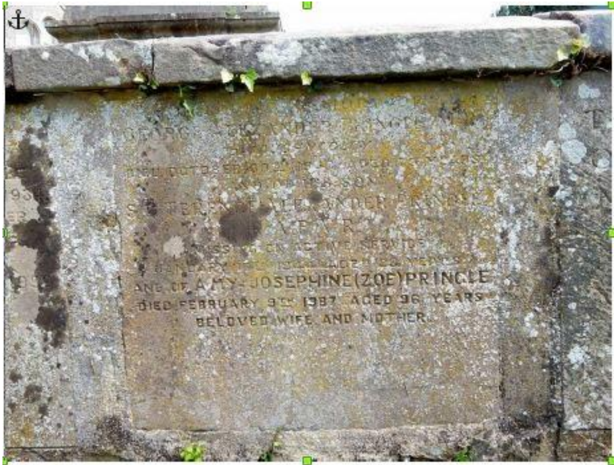
Pringle Family tombstone St. John's Church of Ireland, Tyrone.